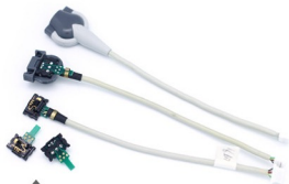
Cable connector design