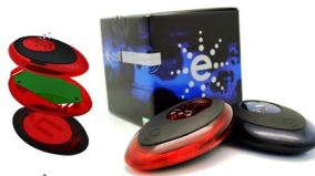
Digital personal medical product