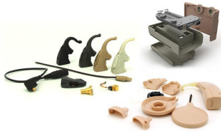
Hearing aids and amplification devices