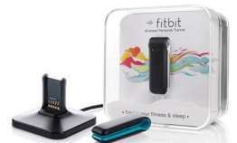
Personal fitness tracker