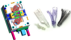
Rotary slider mold and product development parts